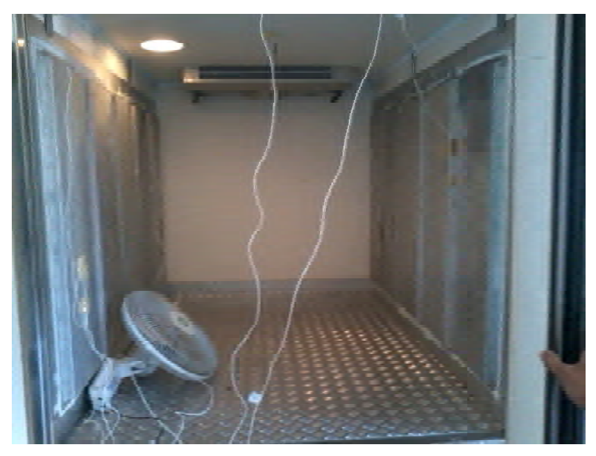
Figure 2: Prototype Green Refrigerated System

To conduct the experiments, a refrigerated van has been retrofitted with phase change material of 0. The size of the refrigerated van was 2m (L) \times 1.8m (H) \times 1.2m (W) . The PUFF insulating material of 100mm thickness was used. Ten closed trays of 1.2m (H) \times 0.3m (W) \times 0.025 m (D) was used to fill the identified phase change material. The storage capacity of each tray was 3400 kJ. A photo snap of the prototype system is shown in figure 2. The material was charged using a conventional refrigerating system operating at -10. After complete charging of the phase change material, it was allowed to discharge to maintain the temperature. During discharging time, air temperature variation with time of the container was recorded and plotted in figure 3. The temperature was maintained about 6 hours.